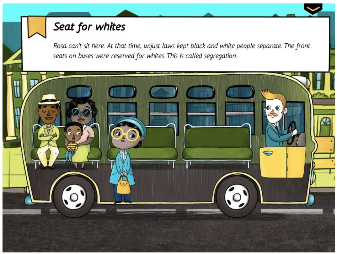
Figure 3: The bus scene in Women Who Changed the World.