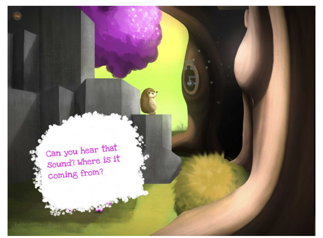
Figure 2: Addressing and instructing the user in Heston Hogs: The Way Home.

During his journey, Heston encounters different animals and challenges. Many of these interactions and tasks engage the user in various ways while the text addresses its reader in multiple places, asking them to help Heston or finish small tasks. For instance, in a scene where Heston is chasing a dragonfly, the narrator asks the user to tap the characters to affect their movement. This kind of addressing invites the user to identify and empathize with the young hedgehog; when Heston is hit by a thunderstorm, the user needs to give him a gentle stroke for comfort. In many scenes, the story does not continue without completing the tasks, such as tapping the right hotspots, finding objects, or swiping the screen. Only a limited and inconsistent amount of directions is given; in some scenes a dot appears on the screen to direct the user, but in other scenes the user needs to find the solution without assistance (see Figure 2).