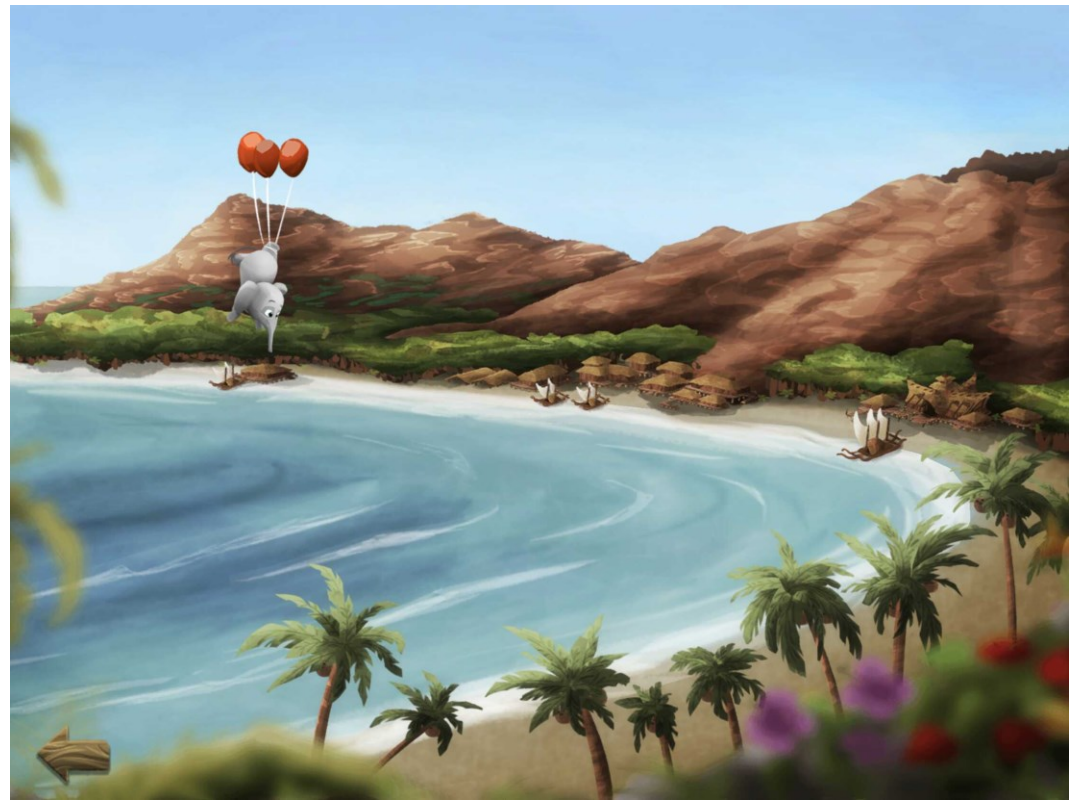
Figure 4: One of the landscapes in 3 Red Balloons.