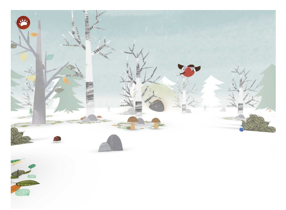
Figure 6: An immersive AR scene in the Mur app.